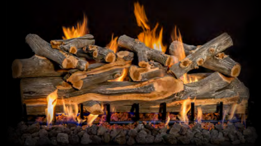
2-Burner Arizona Juniper 42"