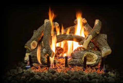
2-Burner Arizona Weathered Oak Charred 24"