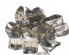
Apollo Bronze Item # RFG-10-AB