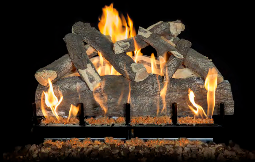
3-Burner Blue Pine Split 30"