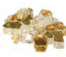
Amber Diamond Item # RFG-10-AG