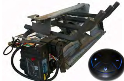
IPI Electric with Burner Puck Remote included with this Variable Electric model only.