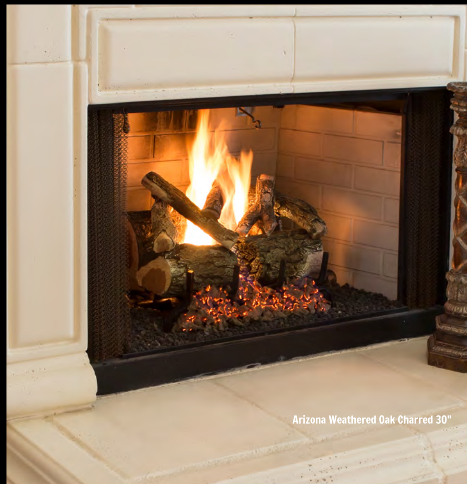
Arizona Weathered Oak Charred 30"