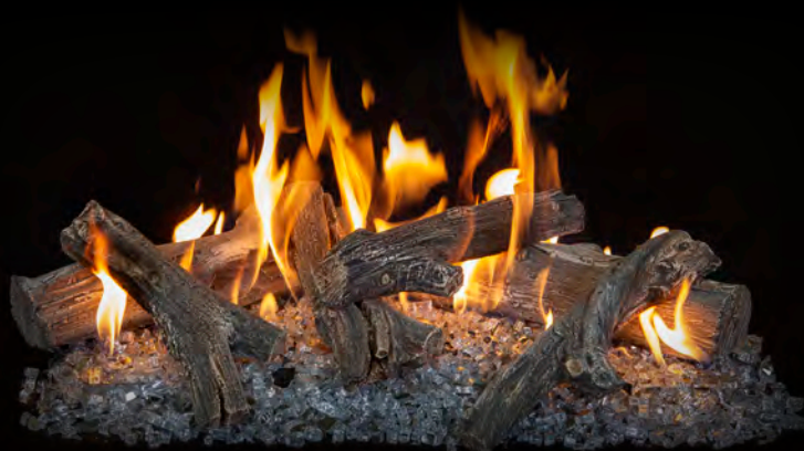
Glass Burner with 24" Driftwood Logs