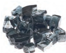
Vesper Black Item # RFG-10-VB