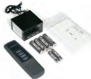
85K BTU Rating Item # GCRK