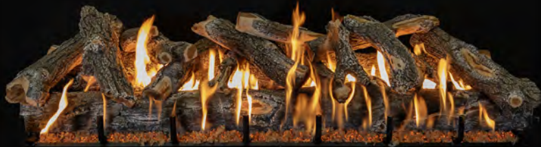
2-Burner Arizona Weathered Oak 60" Also available in 48"