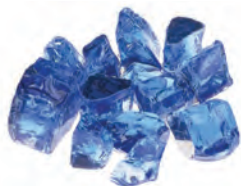
Poseidon Blue Item # RFG-10-PB

1/2" Reflective Glass is sold in 10 pound clear plastic containers. Athena glass is designed for use in fire-pits and other fire features. When the glass is in a fire-pit or fire feature - Do not touch the glass as it is hot and will cause 3rd degree burns. Keep away from children.