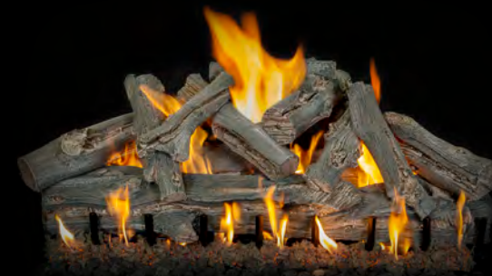
2-Burner Arizona Western Driftwood 42"