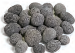
2"-3" Lava Pebbles Available in 50 lb. Bags Item # NL-5080