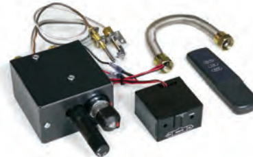
120K (NG & LP) BTU Rating Item # MMVKR-LP or MMVKR-NG