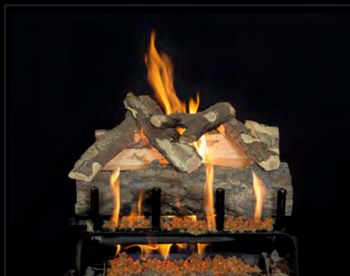
3-Burner Blue Pine Split 18"