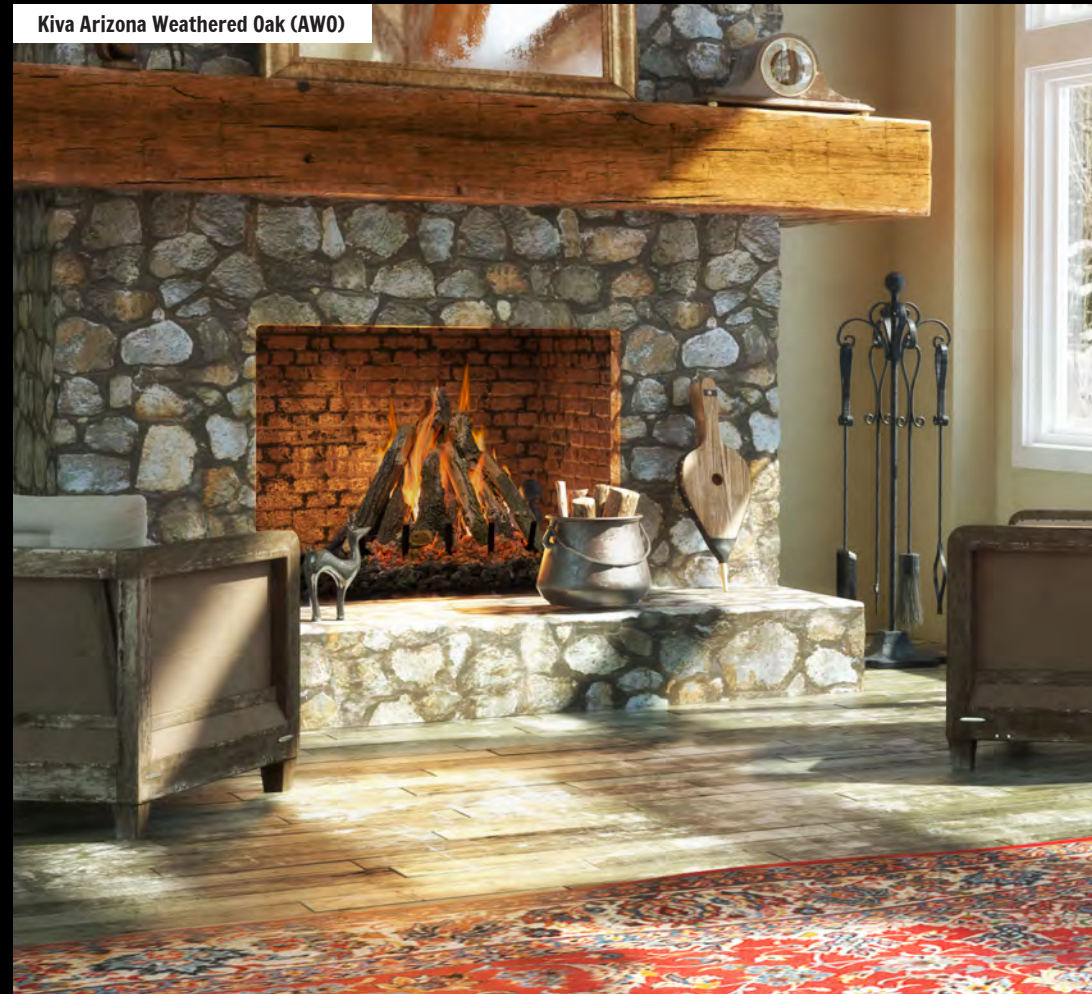
Kiva Arizona Weathered Oak (AWO)