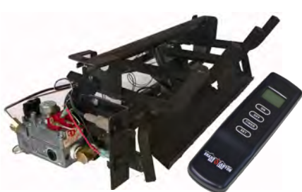
Standard Millivolt with Burner & Remote