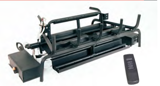
Assembled burner propane with battery electronic and remote system. 3BRN-##-***-MVKEI-GCRK