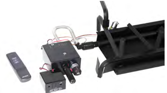
Assembled burner natural gas with modulating millivolt and remote system. 2BRN-##-***-MMVR