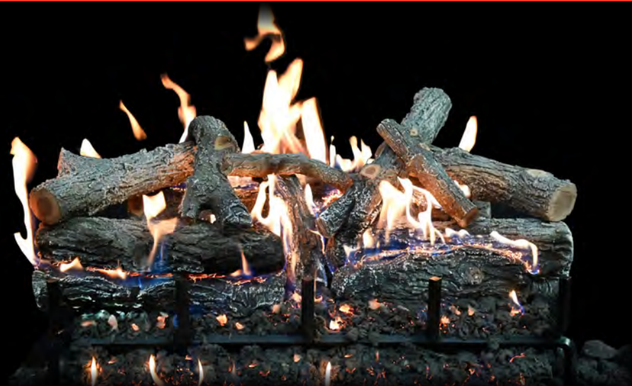
Lava Burner Series - GlowFire™ Logs AZ Weathered Oak Charred 30"