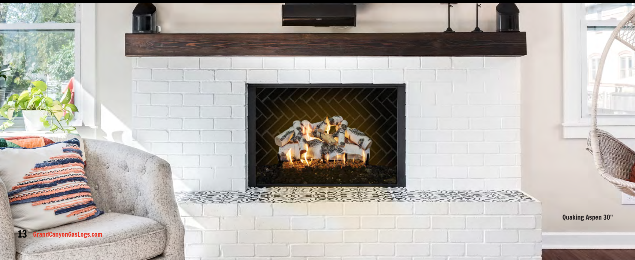
Quaking Aspen 30"