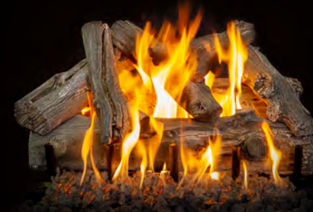
2-Burner Arizona Western Driftwood 24"