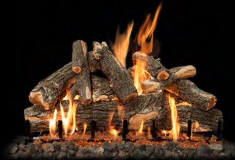
2-Burner Arizona Weathered Oak 36"