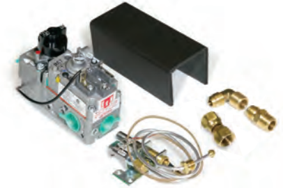
82K Natural Gas BTU Rating 110K Propane BTU Rating Item # MVQMKLP or MVQMKN