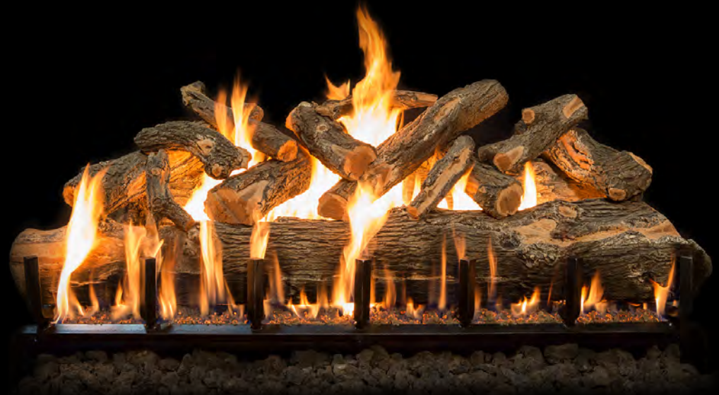
Jumbo-Burner - Jumbo Arizona Weathered Oak 60"