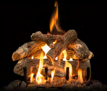
2-Burner Arizona Weathered Oak 18"

Arizona Weathered Oak (AWO) Available in 18", 21", 24", 30", 36", 42", 48" and 60". Front View and See-Through. Burner compatibility 2 and 3 burner.