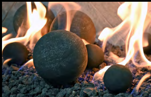
Fireplace Fiber Cannonballs