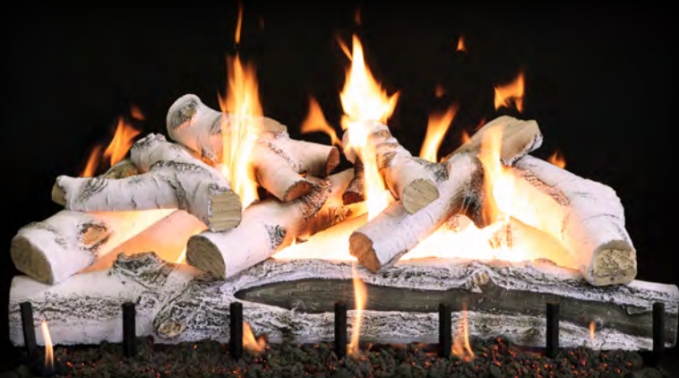
2-Burner Quaking Aspen 36"