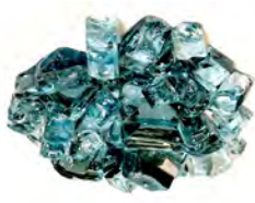
Adriatic Topaz Item # RFG-10-AT