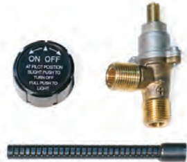
90K BTU Rating Item # MA