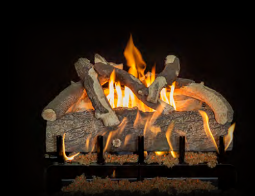
3-Burner Blue Pine Split 24"