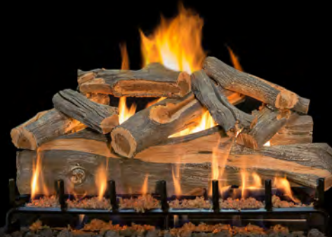
3-Burner Arizona Juniper 36"