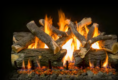
3-Burner Arizona Weathered Oak Charred 36"