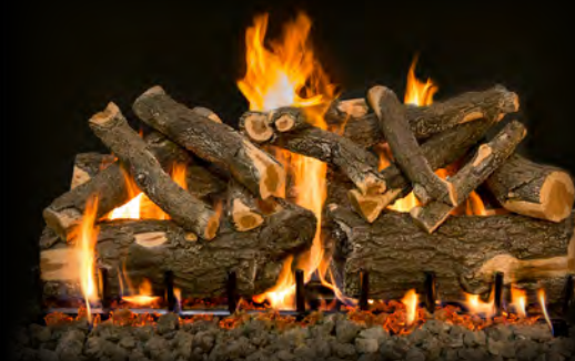
3-Burner Arizona Weathered Oak Charred 42"