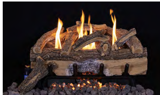
24" Split Oak Gas Logs