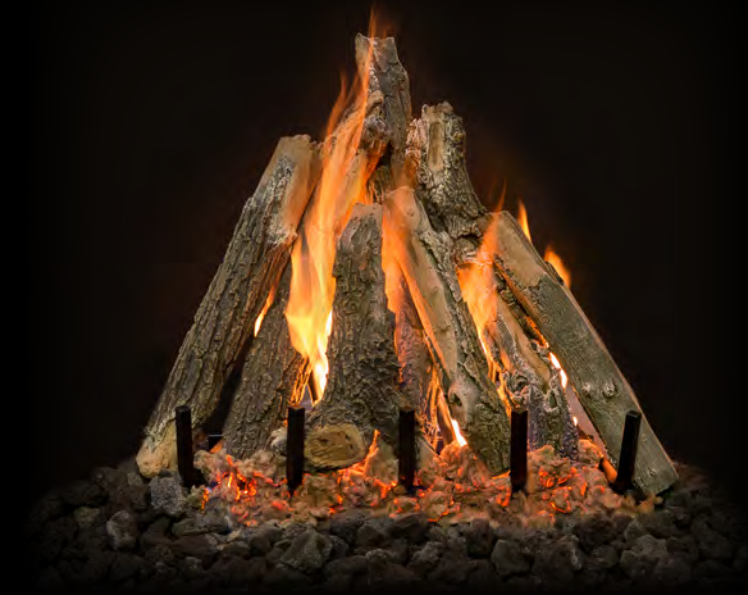
Kiva Arizona Weathered Oak (AWO)