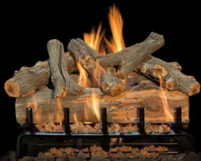
3-Burner Arizona Juniper 24"