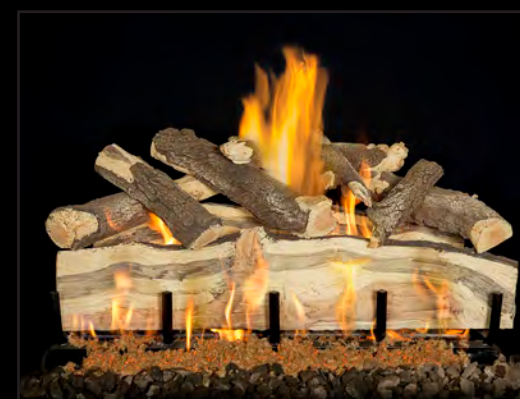
2-Burner Blue Pine Split 30"