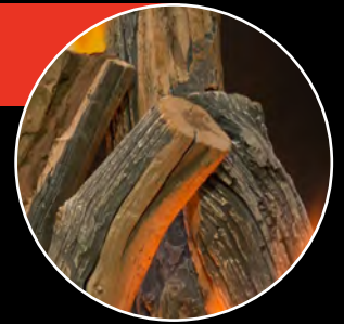
Kiva Arizona Juniper (AJ)