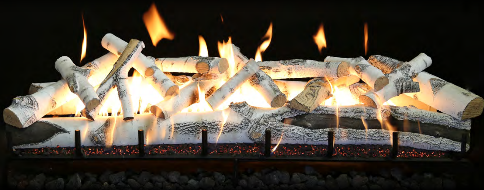
2-Burner Quaking Aspen 60"