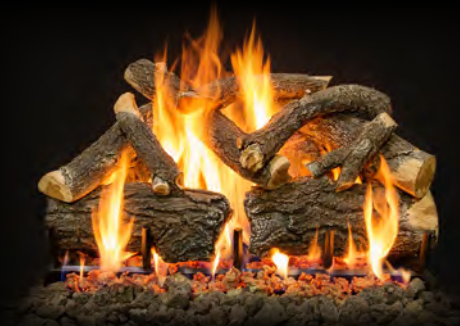
2-Burner Arizona Weathered Oak Charred 30"