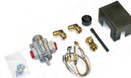
142K BTU Rating Item # HCSPK-LP or HCSPK-N