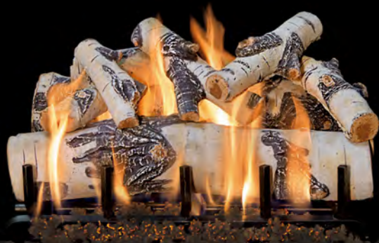
2-Burner Quaking Aspen 24"