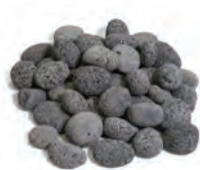
1"-2" Lava Pebbles Available in 50 lb. Bags Item # NL-3050