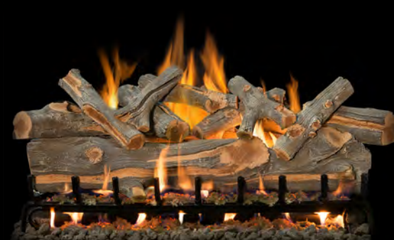
3-Burner Arizona Juniper 42"