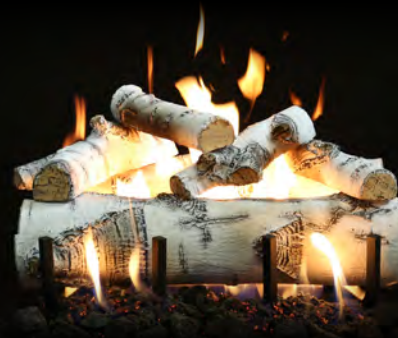
2-Burner Quaking Aspen 18"