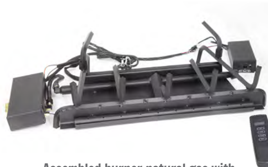
Assembled burner natural gas with battery electronic and remote system. 2BRN-##-***-MVKEI-GCRK