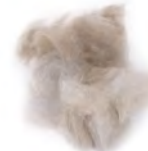
1 Gram Item # PEB-1