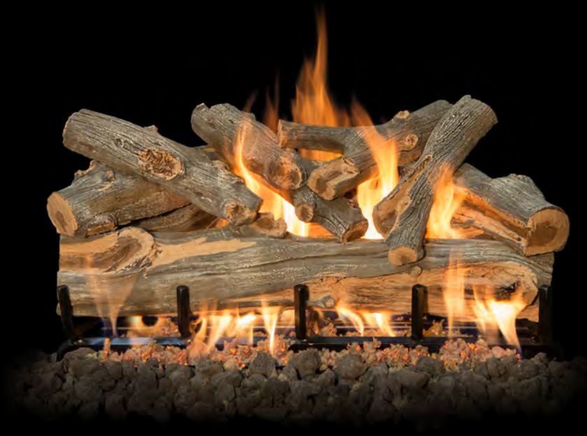
2-Burner Arizona Juniper 30"