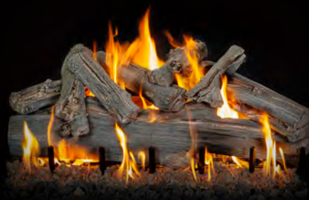
2-Burner Arizona Western Driftwood 36"