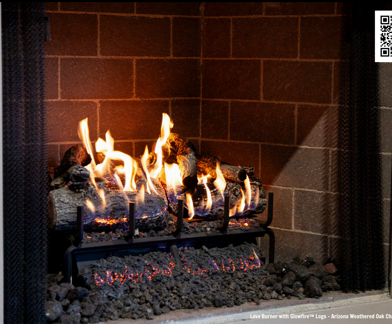
Lava Burner with Glowfire™ Logs - Arizona Weathered Oak Charred 24"