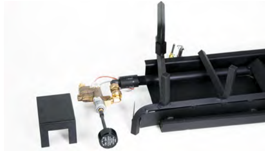
Assembled burner natural gas with safety pilot system. 2BRN-##-***-SP