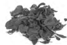
6 oz Bag Item # GLE-6B