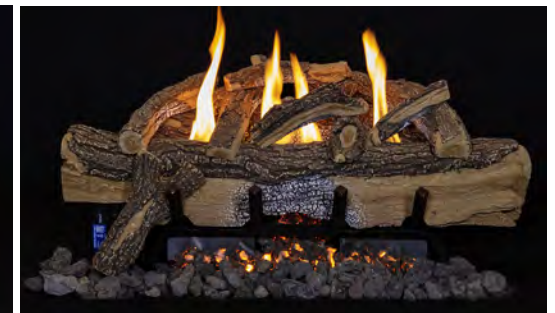
30" Split Oak Gas Logs