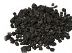
6 oz Bag Item # VEM-6