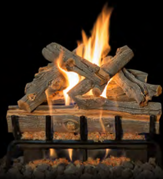
3-Burner Arizona Juniper 21"