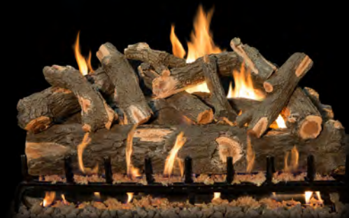
3-Burner Arizona Weathered Oak 42"