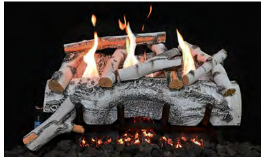
NEW 24" Aspen Birch Gas Logs