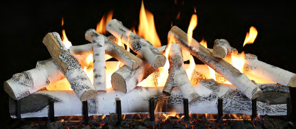
2-Burner Quaking Aspen 42"