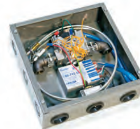
200K Natural Gas BTU Rating 320K Propane BTU Rating Item # EIS, EIS-LP, EIS-10 or EIS -LP-10