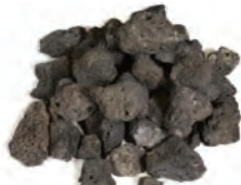
Lava Rock Available in 10 lb. Bags Item # HP-B-R-10