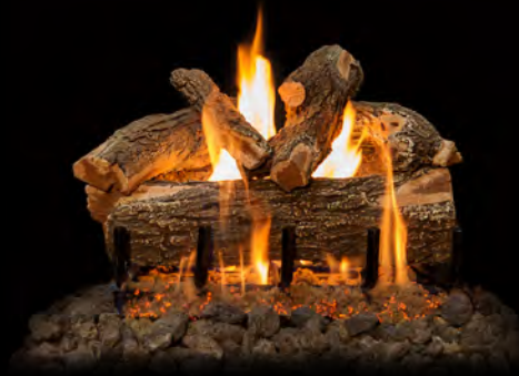
2-Burner Arizona Weathered Oak 21"