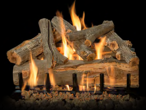
2-Burner Arizona Juniper 24"