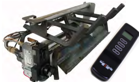
Variable Control with Burner & Remote