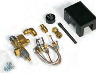
90K BTU Rating Item # SPQMKLP or SPQMKN