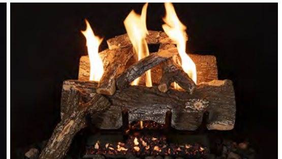
18" Weathered Oak Gas Logs