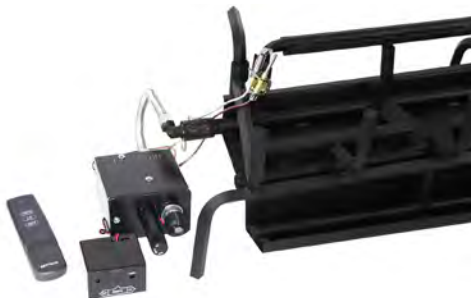
Assembled burner natural gas with modulating millivolt and remote system. 3BRN-##-***-MMVR