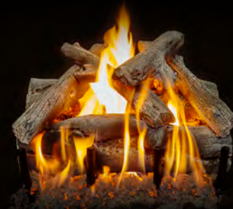
2-Burner Arizona Western Driftwood 18"

Arizona Western Driftwood (WD) Available in 18", 21", 24", 30", 36" and 42". Front View and See-Through. Burner compatibility 2 and 3 burner.