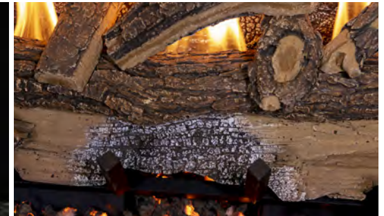
Realistic hand-painted charred logs