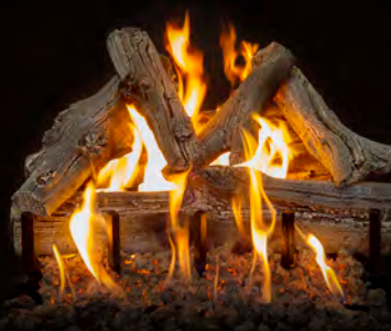
2-Burner Arizona Western Driftwood 21"