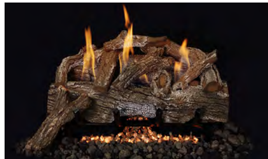
24" Red Oak Gas Logs