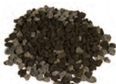
Lava Granules Available in 10 lb. Bags Item # HP-B-GR-10