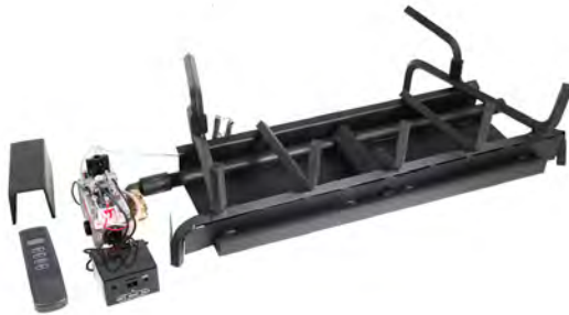
Assembled burner natural gas with millivolt and remote system. 2BRN-##-***-MVK-GCRK