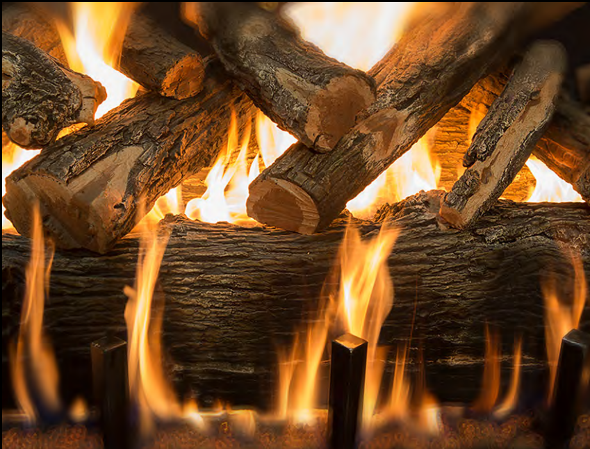
Jumbo-Burner - Jumbo Arizona Weathered Oak 60"