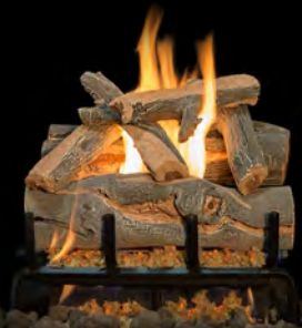
3-Burner Arizona Juniper 18"