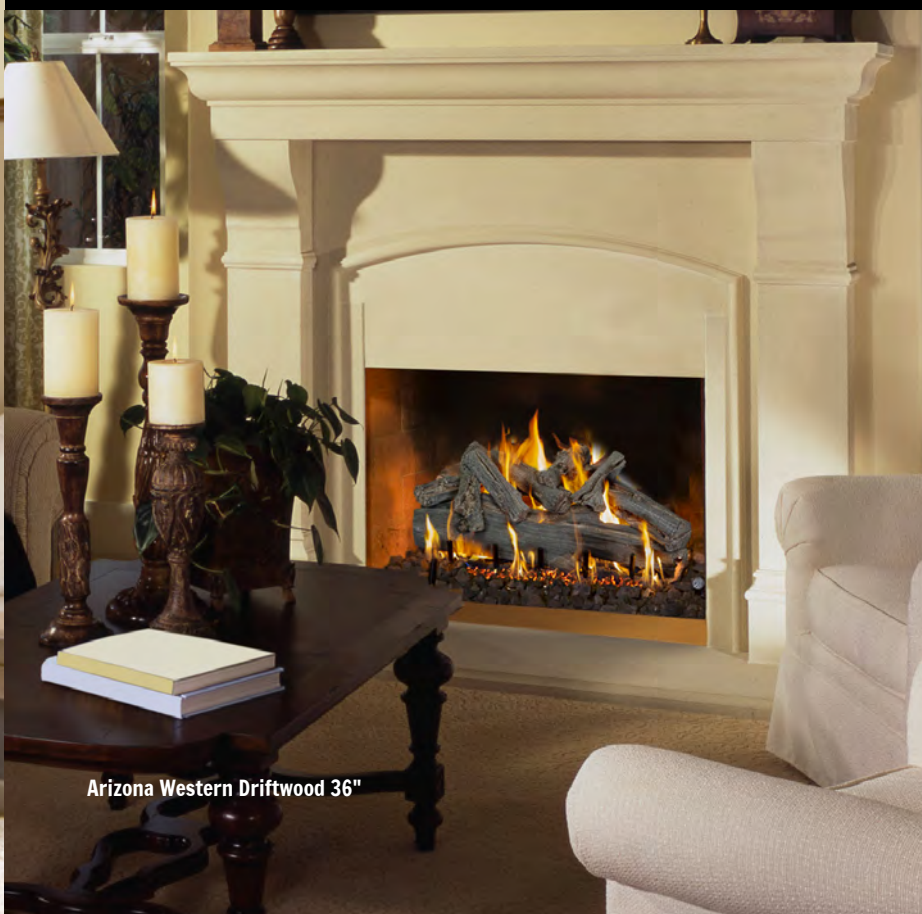
Arizona Western Driftwood 36"