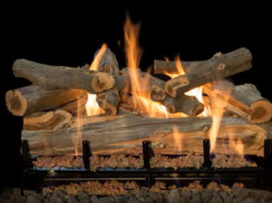
3-Burner Arizona Juniper 30"