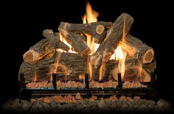
3-Burner Arizona Weathered Oak 30"

Arizona Weathered Oak (AWO) Available in 18", 21", 24", 30", 36", 42", 48" and 60". Front View and See-Through. Burner compatibility 2 and 3 burner.