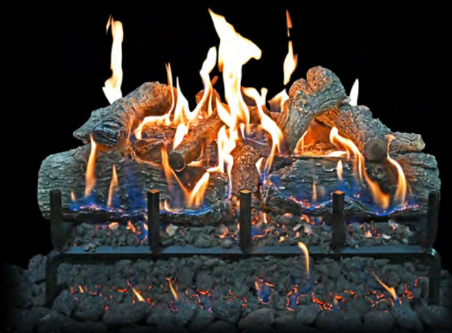
Lava Burner Series - GlowFire™ Logs AZ Weathered Oak Charred 24"