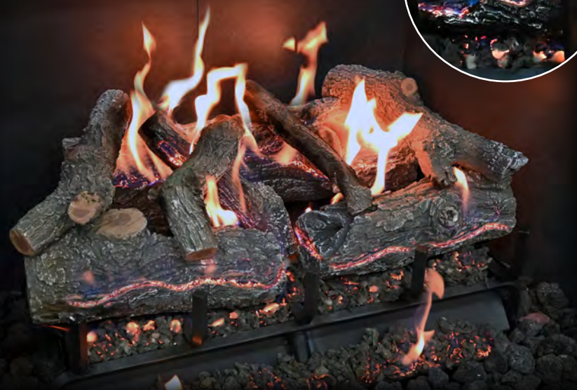
Lava Burner Series - GlowFire™ Logs AZ Weathered Oak Charred 24"