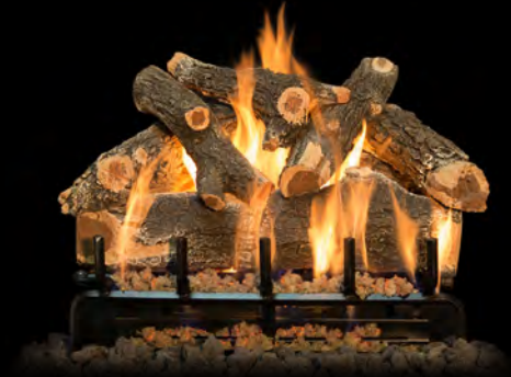
3-Burner Arizona Weathered Oak 24"