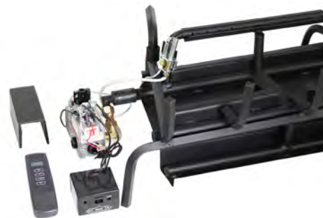
Assembled burner natural gas with millivolt and remote system. 3BRN-##-***-MVK-GCRK