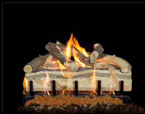
2-Burner Blue Pine Split 24"