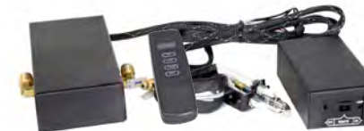
120K Natural Gas BTU Rating 140 K Propane BTU Rating Item # MVKEIKLP or MVKEIKN