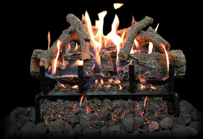
Lava Burner Series - GlowFire™ Logs AZ Weathered Oak Charred 18"