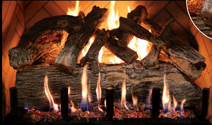
Jumbo-Burner - Jumbo Arizona Weathered Oak 36"