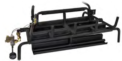
Assembled burner natural gas with safety pilot system. 3BRN-##-***-SP