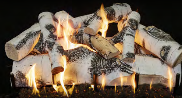
2-Burner Quaking Aspen 30"