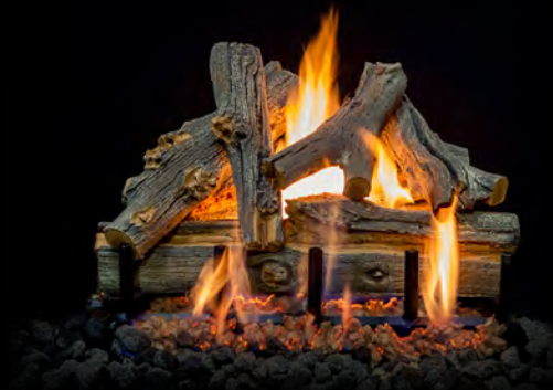
2-Burner Arizona Juniper 21"