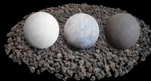
6" Cannonballs - White - Gray - Black