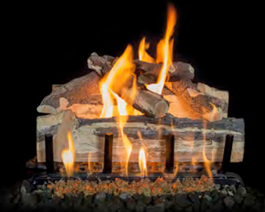
2-Burner Blue Pine Split 18"