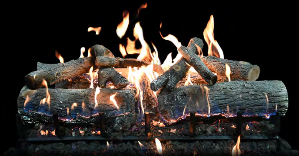
Lava Burner Series - GlowFire™ Logs AZ Weathered Oak Charred 36"