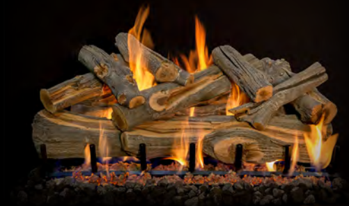
2-Burner Arizona Juniper 36"