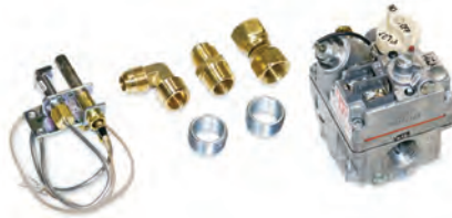
240K Natural Gas BTU Rating 320K Propane BTU Rating Item # HCMVQMKLP or HCMVQMKN