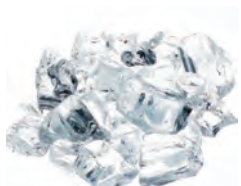
Krystallo Diamond Item # RFG-10-KD