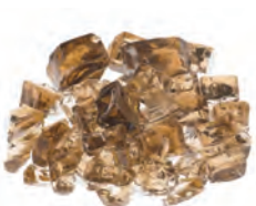
Terra Copper Item # RFG-10-TC