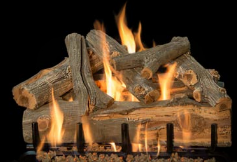
2-Burner Arizona Juniper 24"