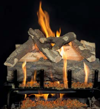
3-Burner Blue Pine Split 18"