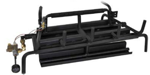
Assembled burner natural gas with safety pilot system. 3BRN-##-***-SP