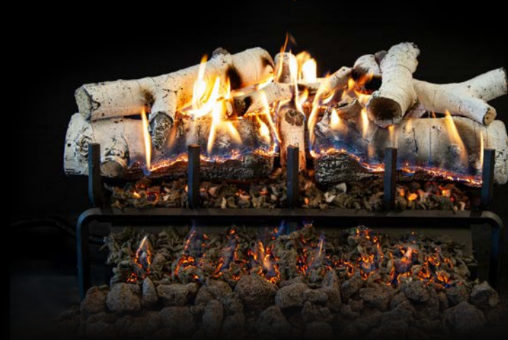
Lava Burner Series - GlowFire White Birch Charred 24"