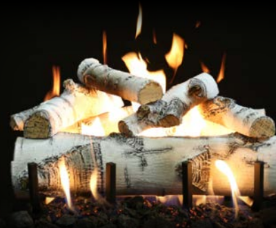
2-Burner Quaking Aspen 18"