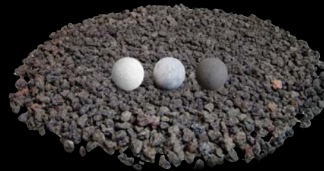
2" Cannonballs - White - Gray - Black