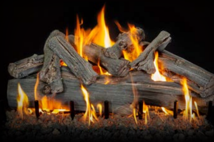
2-Burner Arizona Western Driftwood 36"