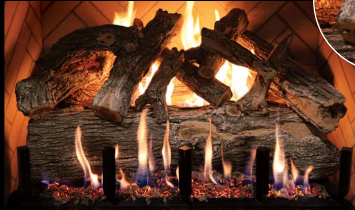
Jumbo-Burner - Jumbo Arizona Weathered Oak 36"