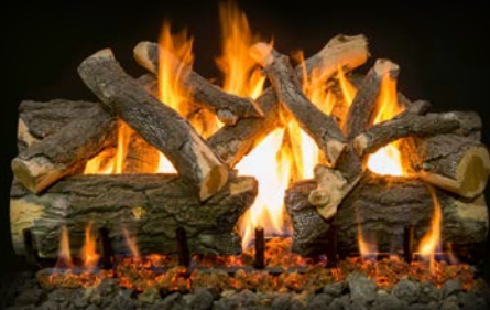
3-Burner Arizona Weathered Oak Charred 36"