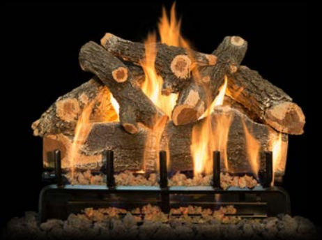
3-Burner Arizona Weathered Oak 24"