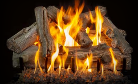
2-Burner Arizona Western Driftwood 24"