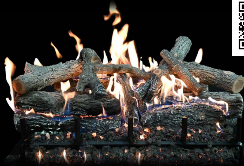
Lava Burner Series - GlowFire™ Logs AZ Weathered Oak Charred 30"