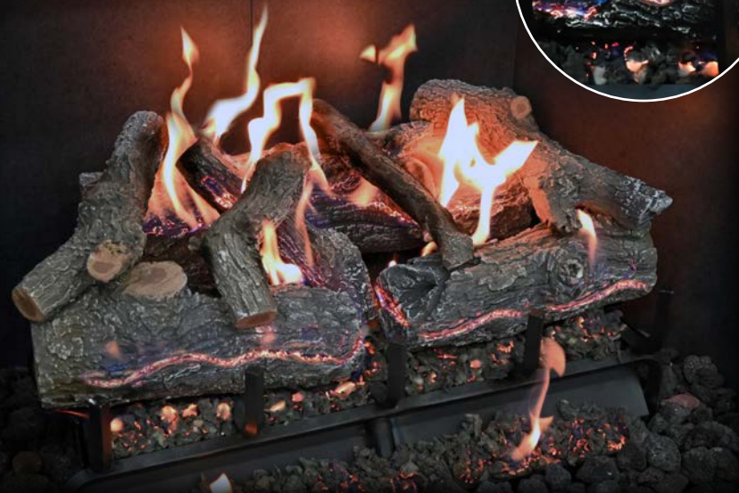
Lava Burner Series - GlowFire™ Logs AZ Weathered Oak Charred 24"