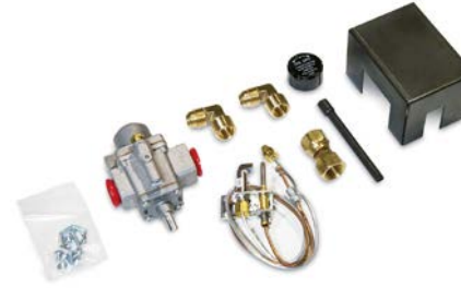
142K BTU Rating Item # HCSPK-LP or HCSPK-N