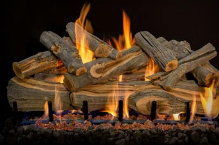
2-Burner Arizona Juniper 36"