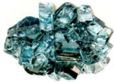
Adriatic Topaz Item # RFG-10-AT