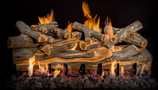
2-Burner Arizona Juniper 42"