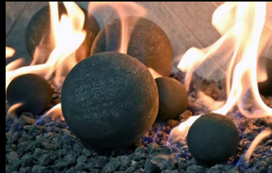
Fireplace Fiber Cannonballs