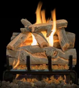
3-Burner Arizona Juniper 18"