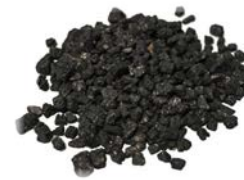
6 oz Bag Item # VEM-6