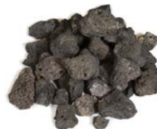
Lava Rock Available in 10 lb. Bags Item # HP-B-R-10