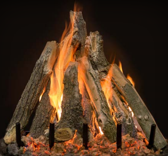
Kiva Arizona Weathered Oak (AWO)