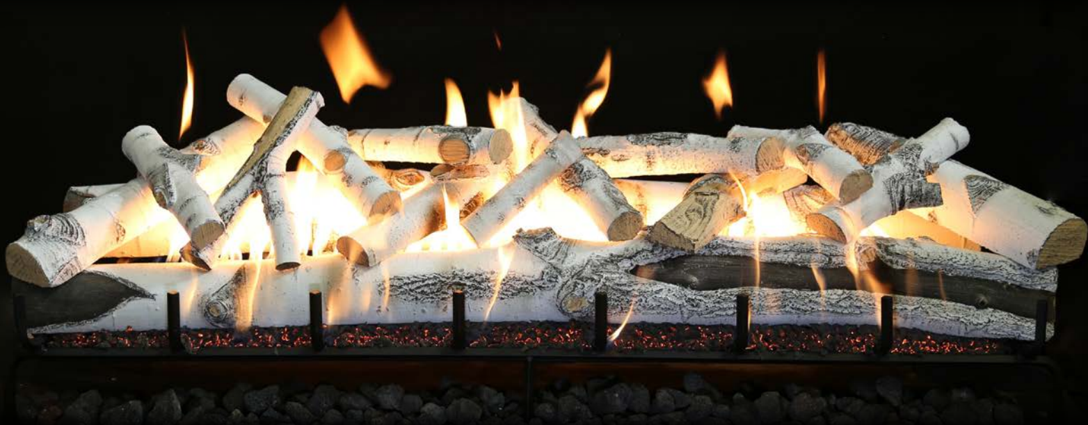
2-Burner Quaking Aspen 60"