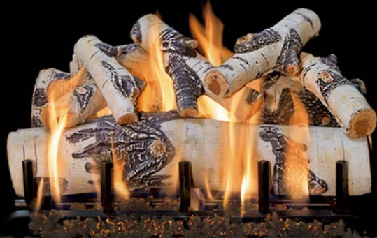
2-Burner Quaking Aspen 24"

Here is Grand Canyon Gas Logs' signature birch set. This traditional birch log set balances the cream whites with the scarred black bark from the winter snows. Item # ASPEN##LOGS