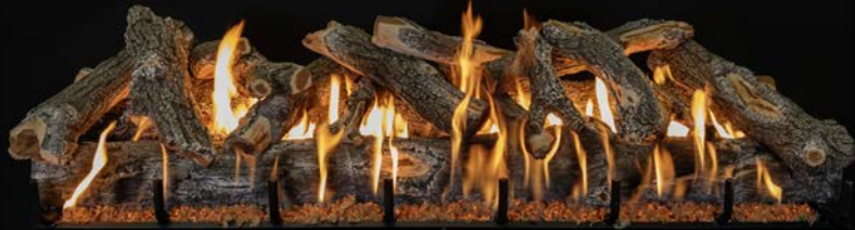
2-Burner Arizona Weathered Oak 60" Also available in 48"