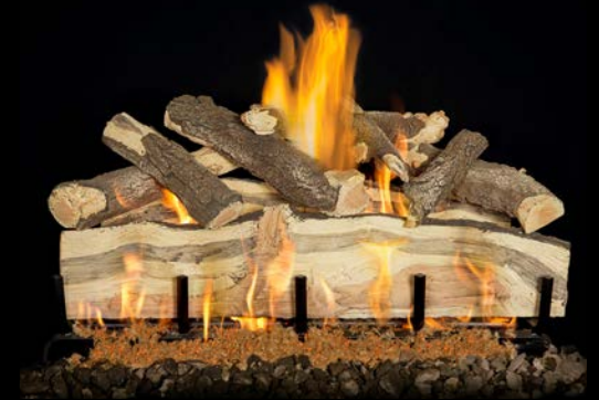
2-Burner Blue Pine Split 30"