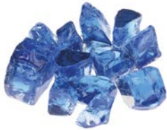
Poseidon Blue Item # RFG-10-PB

1/2" Reflective Glass is sold in 10 pound clear plastic containers. Athena glass is designed for use in fire-pits and other fire features. When the glass is in a fire-pit or fire feature - Do not touch the glass as it is hot and will cause 3rd degree burns. Keep away from children.