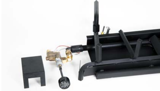
Assembled burner natural gas with safety pilot system. 2BRN-##-***-SP