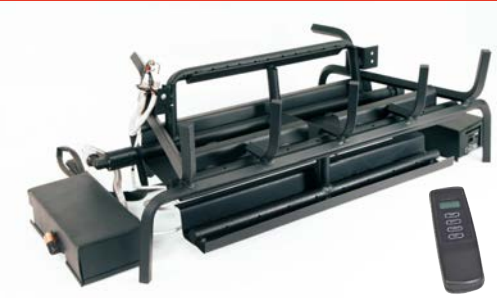
Assembled burner propane with battery electronic and remote system. 3BRN-##-***-MVKEI-GCRK