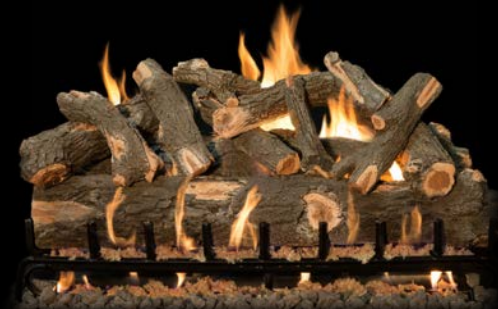
3-Burner Arizona Weathered Oak 42"