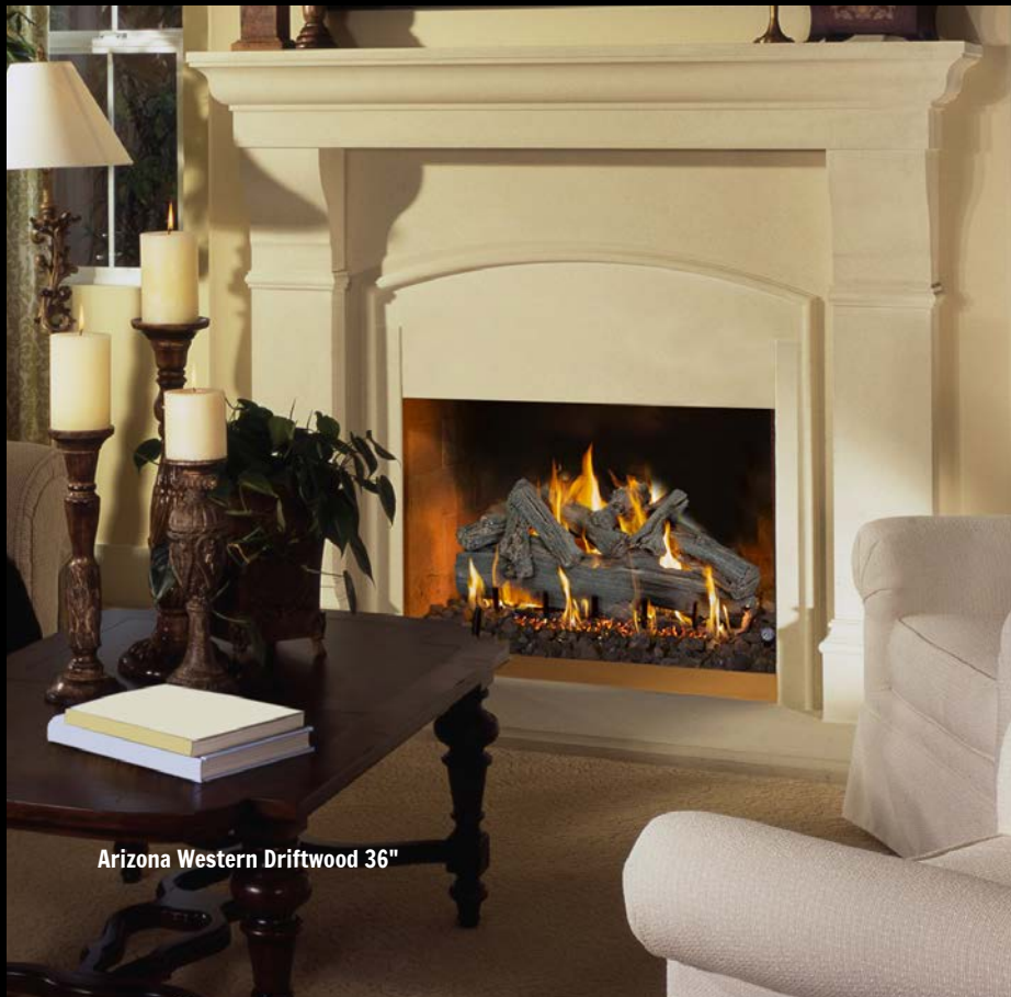
Arizona Western Driftwood 36"