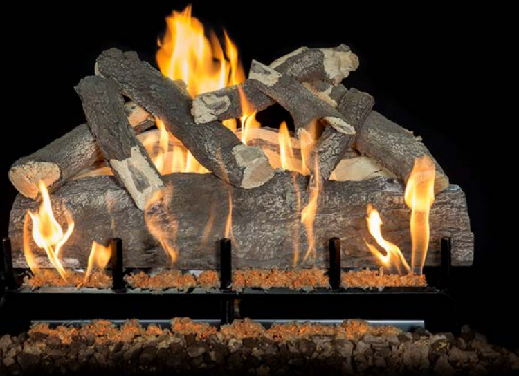
3-Burner Blue Pine Split 30"