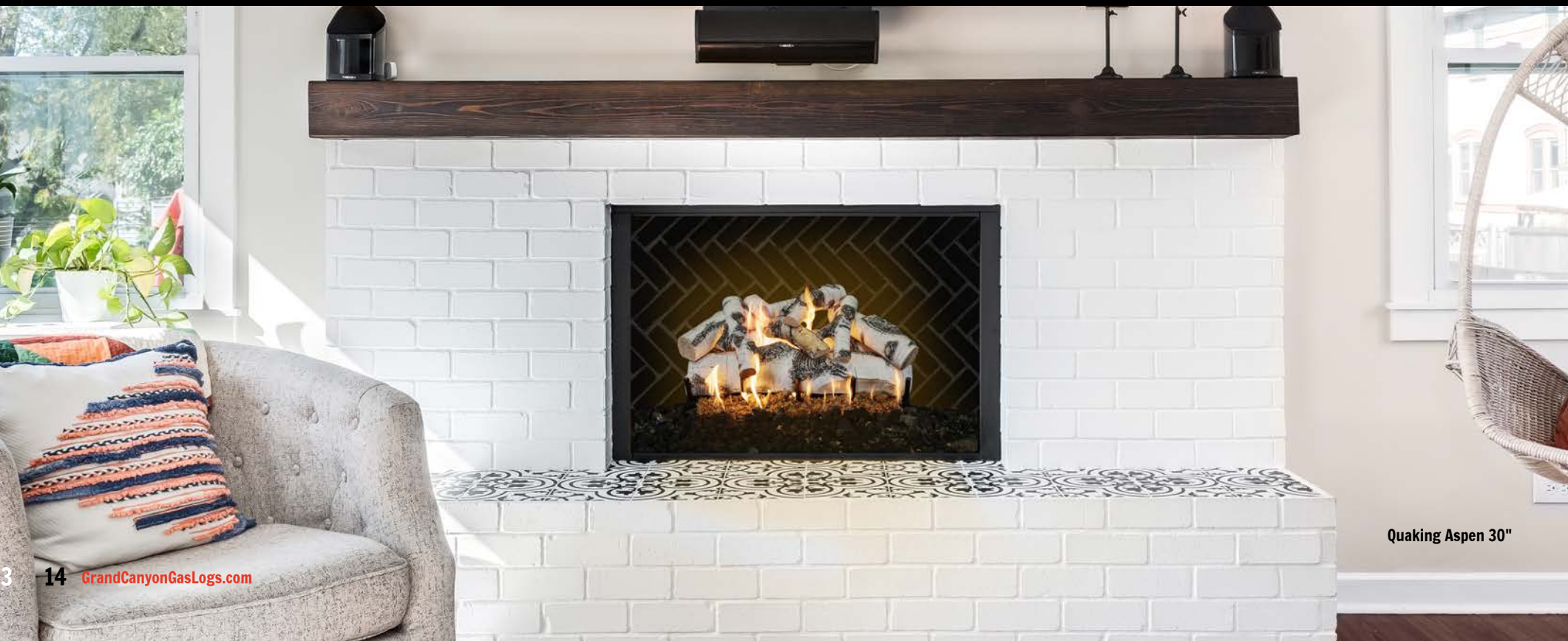
Quaking Aspen 30"