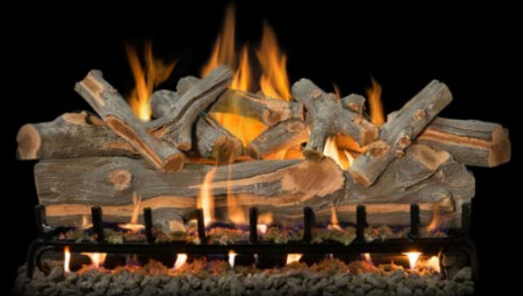
3-Burner Arizona Juniper 42"