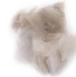
1 Gram Item # PEB-1