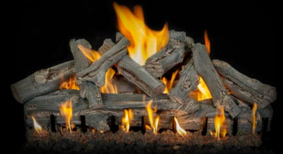
2-Burner Arizona Western Driftwood 42"