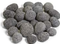
2"- 3" Lava Pebbles Available in 50 lb. Bags Item # NL-5080