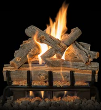
3-Burner Arizona Juniper 21"