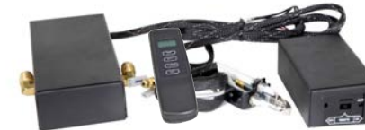
120K Natural Gas BTU Rating 140 K Propane BTU Rating Item # MVKEIKLP or MVKEIKN