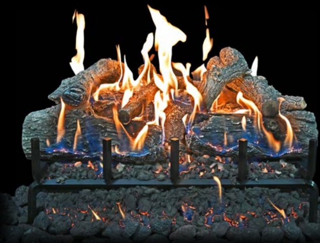
Lava Burner Series - GlowFire™ Logs AZ Weathered Oak Charred 24"