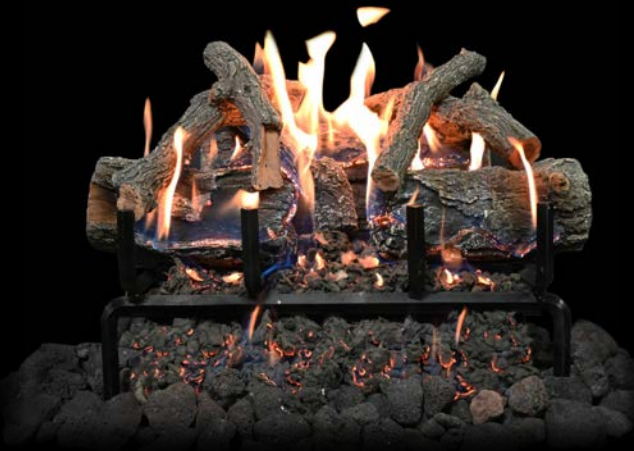
Lava Burner Series - GlowFire™ Logs AZ Weathered Oak Charred 18"