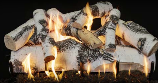
2-Burner Quaking Aspen 30"