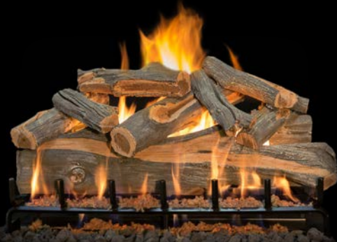
3-Burner Arizona Juniper 36"