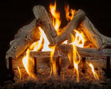
2-Burner Arizona Western Driftwood 21"

Arizona Western Driftwood (WD) Available in 18", 21", 24", 30", 36" and 42". Front View and See-Through. Burner compatibility 2 and 3 burner.