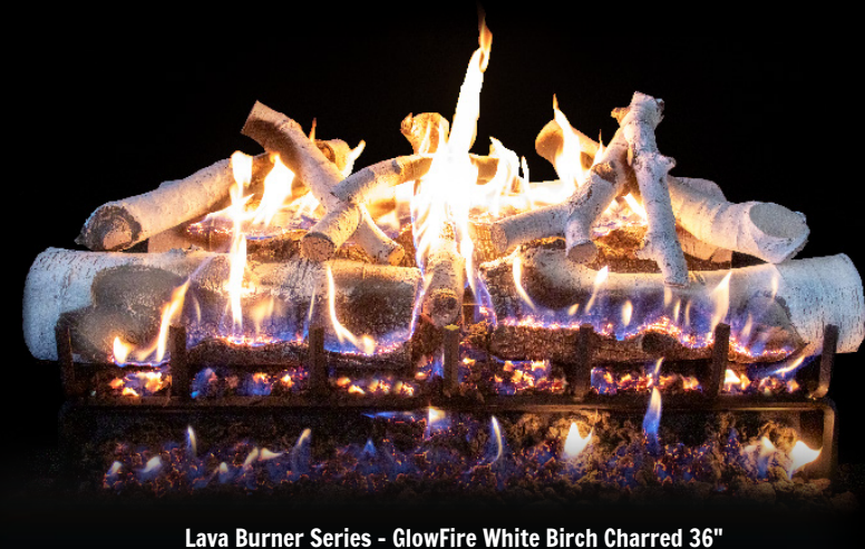
Lava Burner Series - GlowFire White Birch Charred 36"