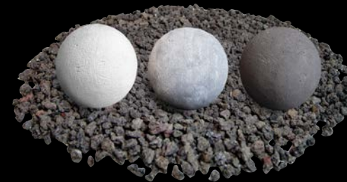
6" Cannonballs - White - Gray - Black