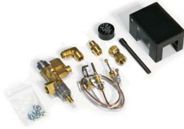
90K BTU Rating Item # SPQMKLP or SPQMKN