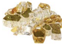
Amber Diamond Item # RFG-10-AG