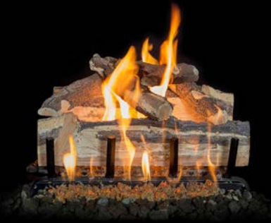
2-Burner Blue Pine Split 18"

Blue Pine Split (BPS) Available in 18", 24" and 30". Front View only. Burner compatibility 2 and 3 burner.