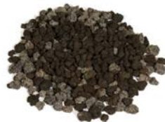
Lava Granules Available in 10 lb. Bags Item # HP-B-GR-10