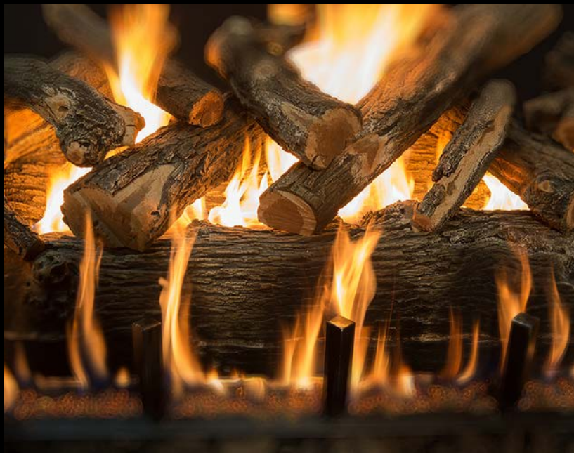
Jumbo-Burner - Jumbo Arizona Weathered Oak 60"