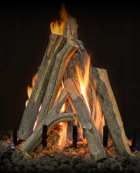
Kiva Arizona Juniper (AJ)