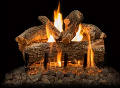
2-Burner Arizona Weathered Oak 21"