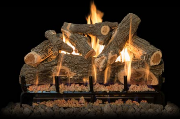
3-Burner Arizona Weathered Oak 30"

Arizona Weathered Oak (AWO) Available in 18", 21", 24", 30", 36", 42", 48" and 60". Front View and See-Through. Burner compatibility 2 and 3 burner.