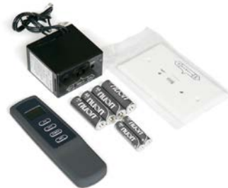
85K BTU Rating Item # GCRK