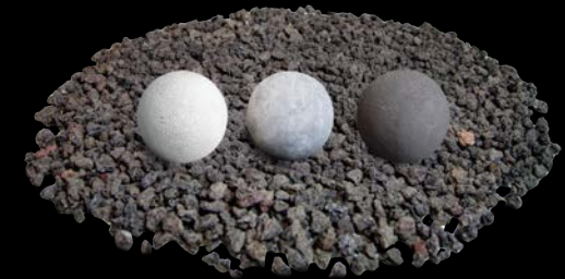
4" Cannonballs - White - Gray - Black