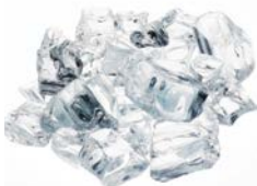
Krystallo Diamond Item # RFG-10-KD