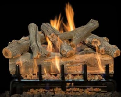
3-Burner Arizona Juniper 24"