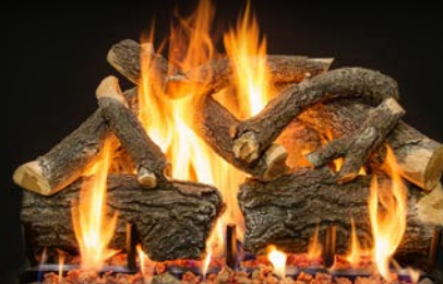
2-Burner Arizona Weathered Oak Charred 30"