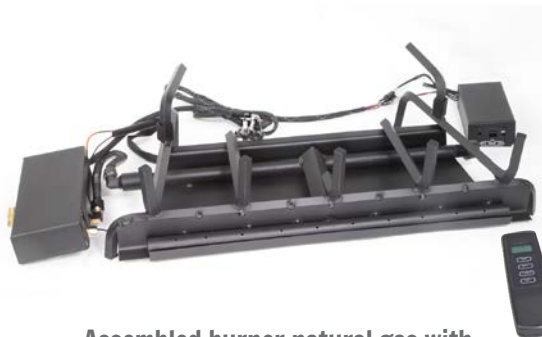
Assembled burner natural gas with battery electronic and remote system. 2BRN-##-***-MVKEI-GCRK