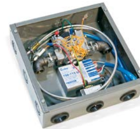
200K Natural Gas BTU Rating 320K Propane BTU Rating Item # EIS, EIS-LP, EIS-10 or EIS-LP-10