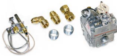
240K Natural Gas BTU Rating 320K Propane BTU Rating Item # HCMVQMKLP or HCMVQMKN