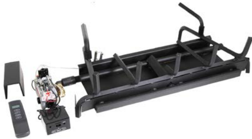
Assembled burner natural gas with millivolt and remote system. 2BRN-##-***-MVK-GCRK