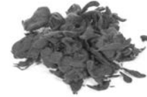
6 oz Bag Item # GLE-6B