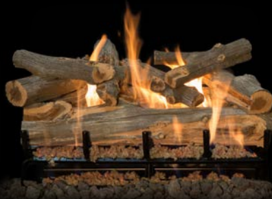
3-Burner Arizona Juniper 30"