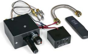
120K (NG & LP) BTU Rating Item # MMVKR-LP or MMVKR-NG