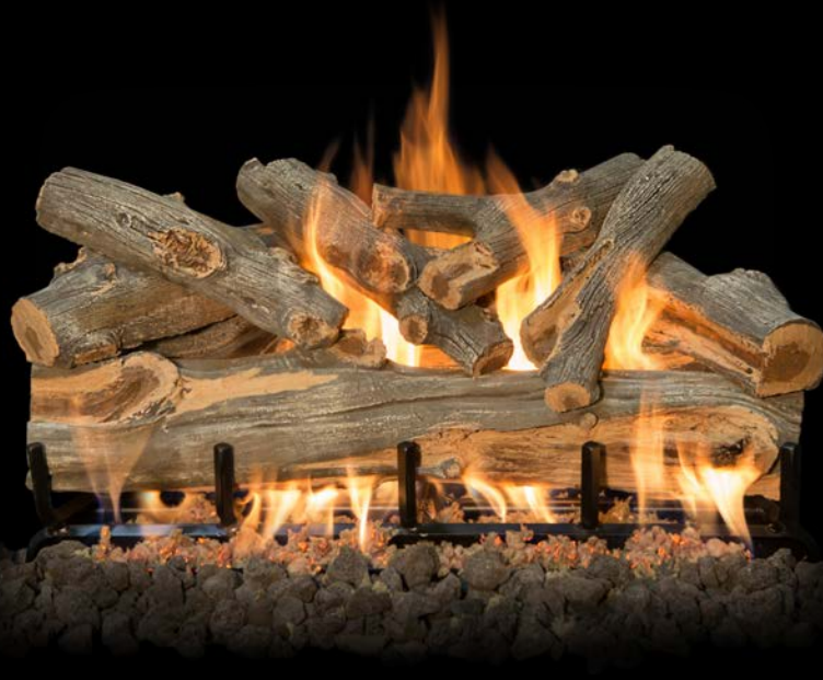
2-Burner Arizona Juniper 30"