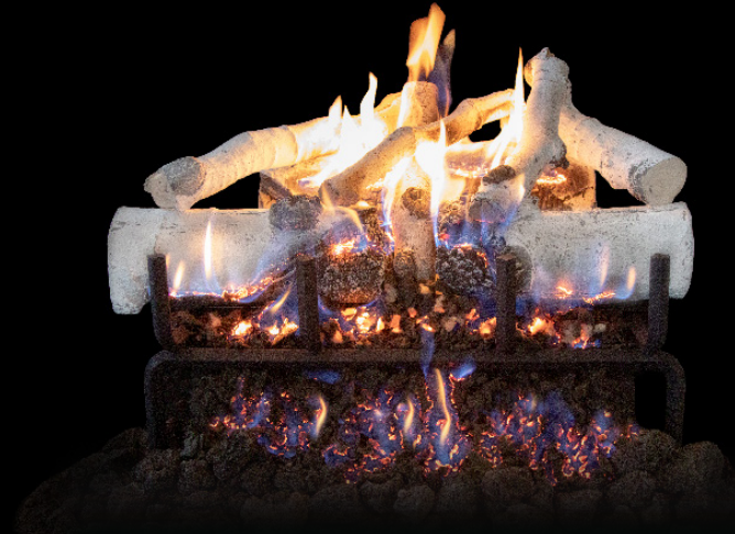
Lava Burner Series - GlowFire White Birch Charred 18"