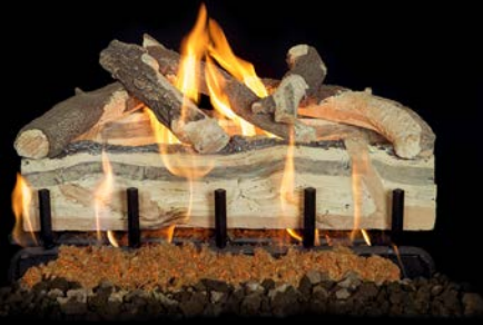
2-Burner Blue Pine Split 24"