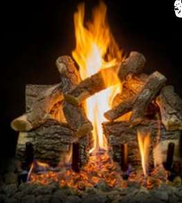
2-Burner Arizona Weathered Oak Charred 18"

Arizona Weathered Oak Charred (AWOC) Available in 18", 24", 30", 36" and 42". Front View and See-Through. Burner compatibility 2 and 3 burner.