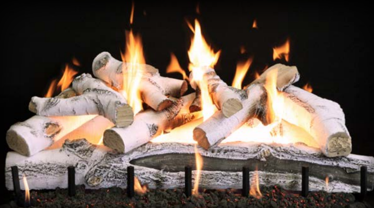
2-Burner Quaking Aspen 36"