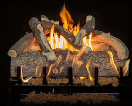
3-Burner Blue Pine Split 24"