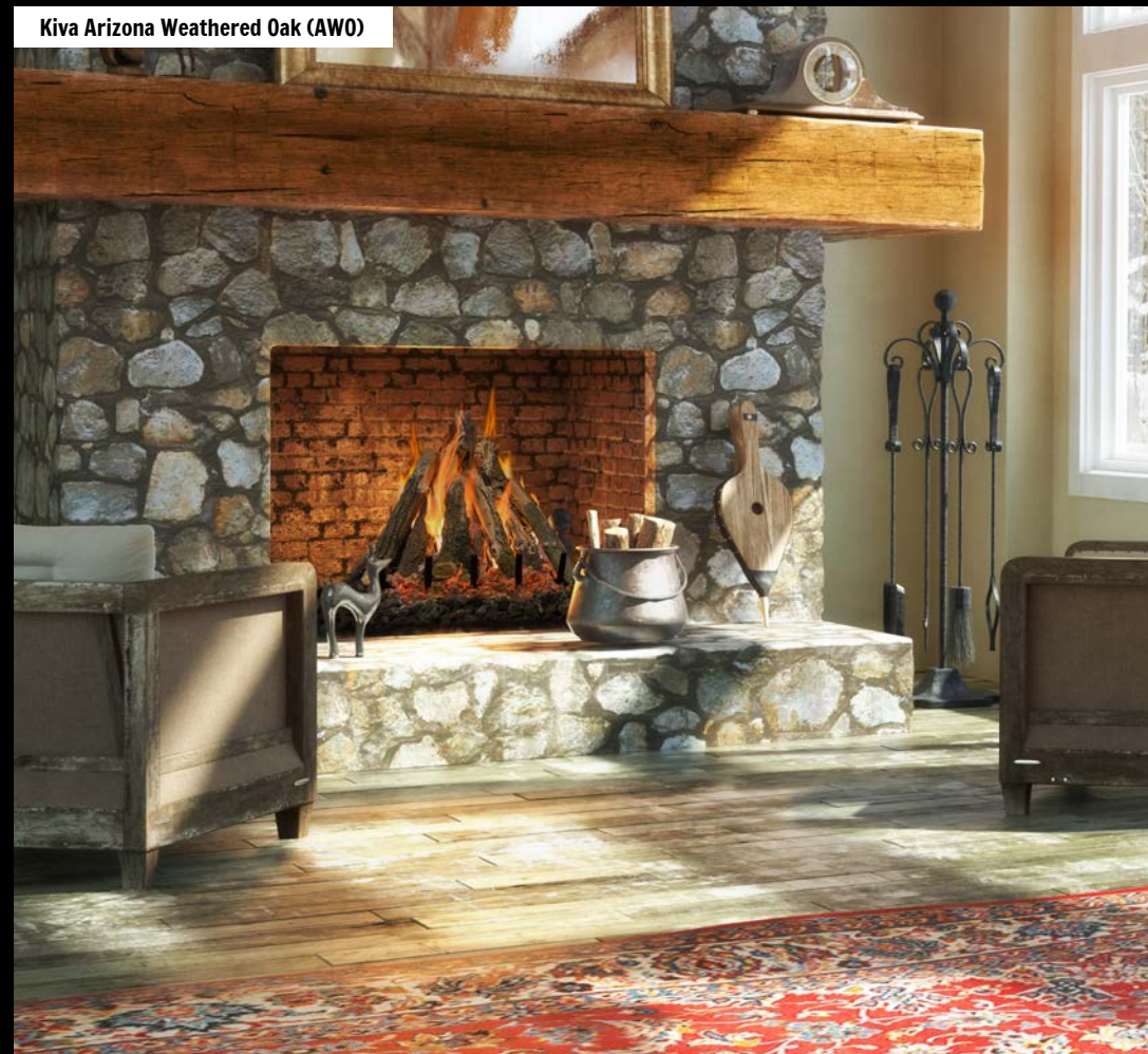
Kiva Arizona Weathered Oak (AWO)