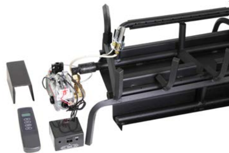
Assembled burner natural gas with millivolt and remote system. 3BRN-##-***-MVK-GCRK