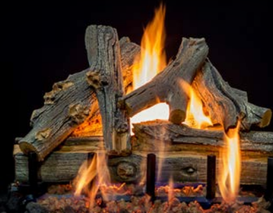
2-Burner Arizona Juniper 21"