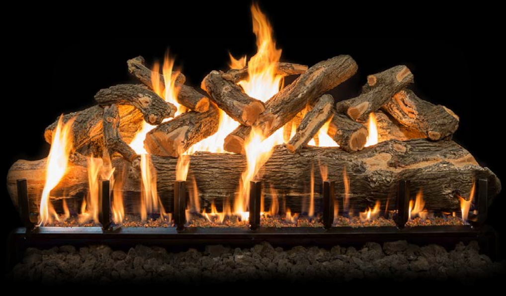
Jumbo-Burner - Jumbo Arizona Weathered Oak 60"