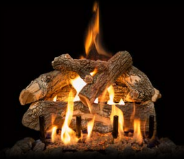
2-Burner Arizona Weathered Oak 18"

Arizona Weathered Oak (AWO) Available in 18", 21", 24", 30", 36", 42", 48" and 60". Front View and See-Through. Burner compatibility 2 and 3 burner.