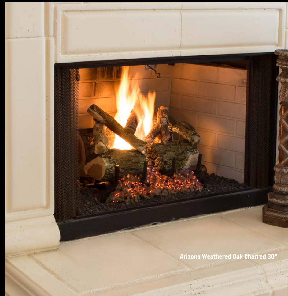
Arizona Weathered Oak Charred 30"