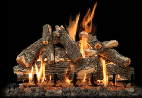
2-Burner Arizona Weathered Oak 36"