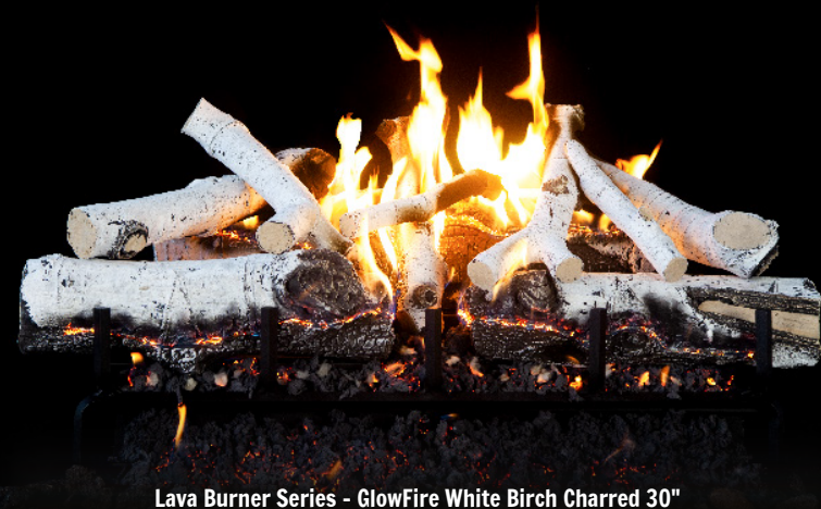
Lava Burner Series - GlowFire White Birch Charred 30"