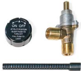
90K BTU Rating Item # MA