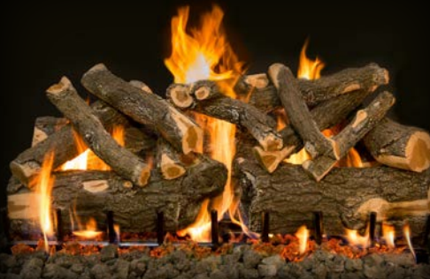
3-Burner Arizona Weathered Oak Charred 42"