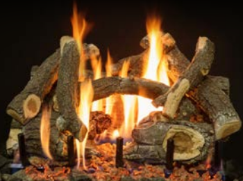
2-Burner Arizona Weathered Oak Charred 24"

Arizona Weathered Oak Charred (AWOC) Available in 18", 24", 30", 36" and 42". Front View and See-Through. Burner compatibility 2 and 3 burner.