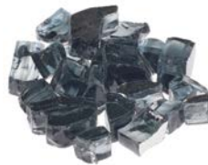
Vesper Black Item # RFG-10-VB