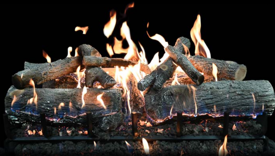
Lava Burner Series - GlowFire™ Logs AZ Weathered Oak Charred 36"