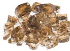
Terra Copper Item # RFG-10-TC