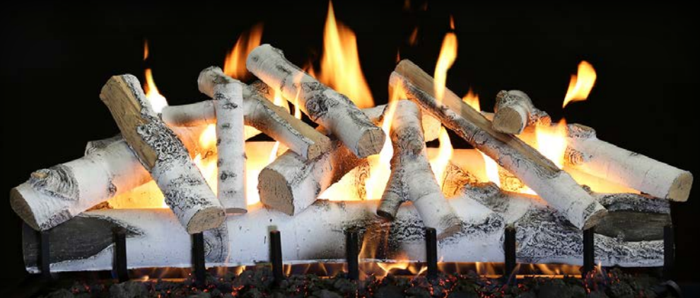
2-Burner Quaking Aspen 42"