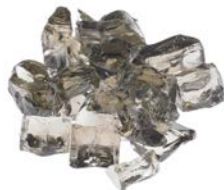
Apollo Bronze Item # RFG-10-AB