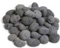
1"- 2" Lava Pebbles Available in 50 lb. Bags Item # NL-3050