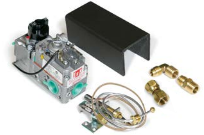
82K Natural Gas BTU Rating 110K Propane BTU Rating Item # MVQMKLP or MVQMKN