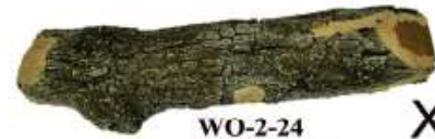
WO-2-24 24.25" x 4" x 7" 23lbs.