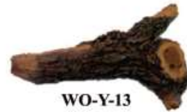
WO-Y-13 12.5" x 8" x 3" 3.12 lbs.